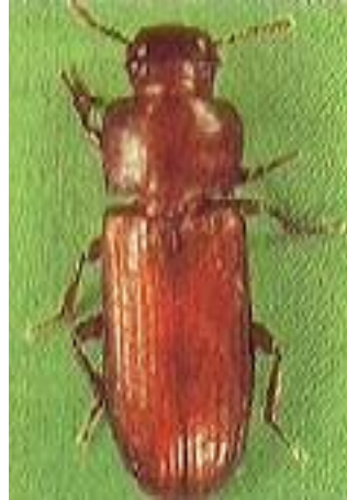
Confused Flour Beetle