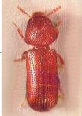
Lesser Grain Borer