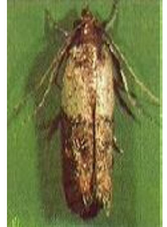
Indian Meal Moth