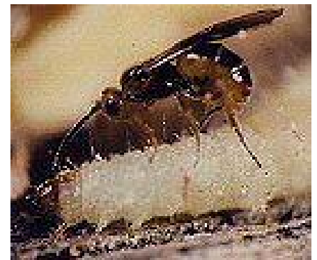
Bracon hebetor beneficial Insect